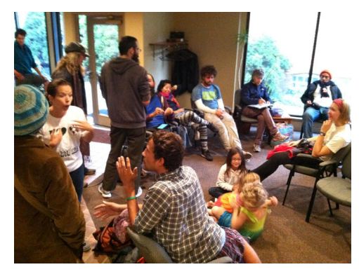
Fellowship in the gathering space

Climate Action March March 1 - November 1, 2014 Los Angeles to Washington, D.C.