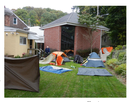
Drying out tents

In early October, Celebration was pleased to offer overnight hospitality for some fifty walkers on their way to Washington to call attention to the seriousness of climate change.