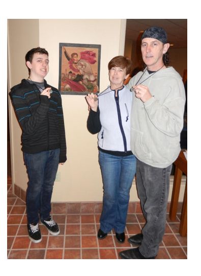
Showing off their new Companion medallions

2014 Conference "Poverty as Lack of Power"