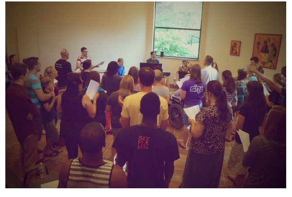
Night of Worship