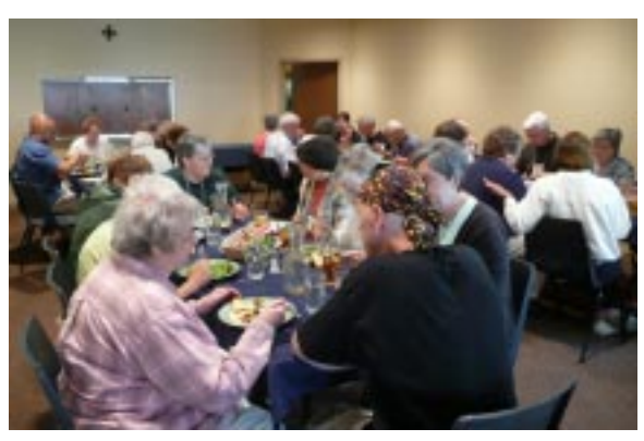
Conferees enjoying food and fellowship

In the National Portrait Gallery in London are two portraits of Queen Elizabeth II. In one of them she stands alone against a plain gray background, clad in a floor-length red robe, a serious expression on her face. The other portrait shows her sitting on a sofa in a richly appointed parlor, wearing a skirt and sweater, looking quite at ease. At her feet are her dogs. Family members, casually dressed, lounge or stand around in various relaxed attitudes. The monarch, the mother, the grandmother: quite recognizably the same person in different modes. This is what we have in the four gospels: quite recognizably the same Jesus, but in different presentations: The Good News told four times