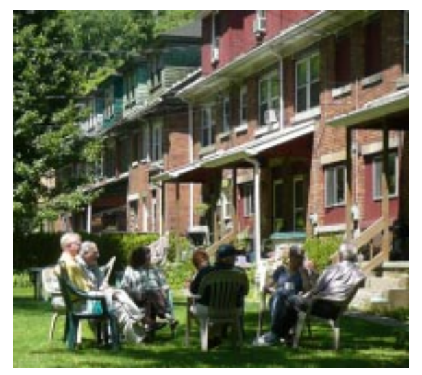
Small Group Session

At this conference we will look at the particular structure, language, content and beauty of each gospel, so as to "see him more clearly, love him more dearly, and follow him more nearly."