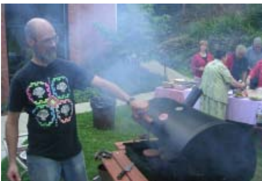
Chef / Caterer