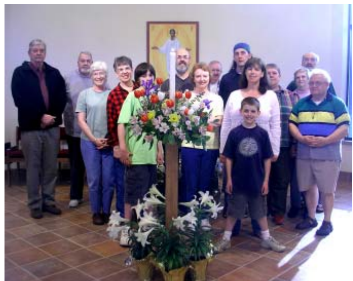
The Community and friends relaxing after Easter Sunday