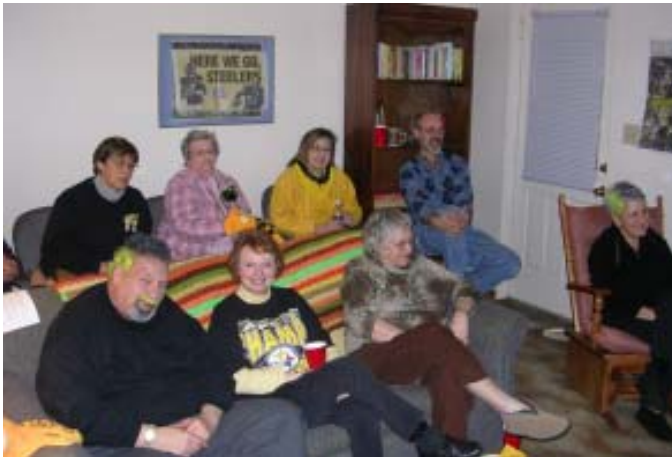
Superbowl fever on Franklin Avenue: Yes, some FAN-atics even colored their hair Steelers' black and gold.