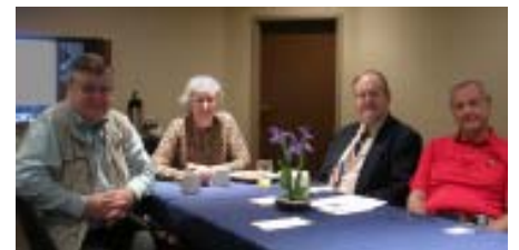
Members of the GOAL Board

With the opportunity of added guest space in All Saints House we welcome visitors, groups, people on holiday or sabbatical to spend time here. You could always stay if you have a stop-over at Pittsburgh airport as we are closer to the airport than downtown Pittsburgh!