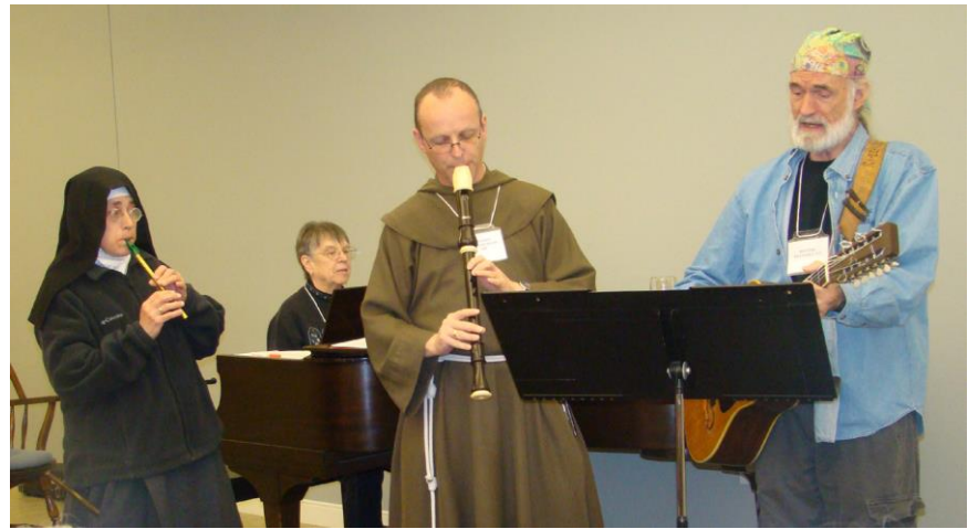
UK Alumni Gathering, October 2016 Salisbury, England

A quick trip to friends in North Carolina