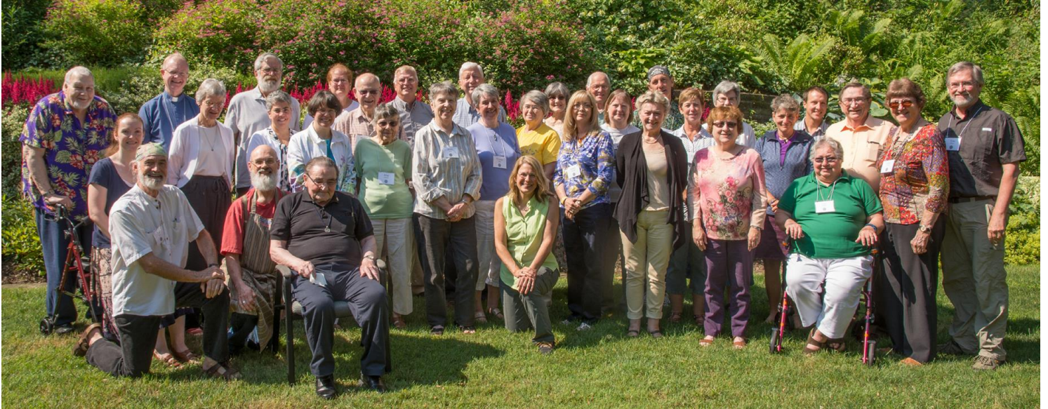
2016 Conference attendees