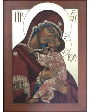
Mother of Tenderness

My ultimate gratification happens when an icon is received and blessed by the Community and is seen by all as a window into the kingdom of God. James, SCC