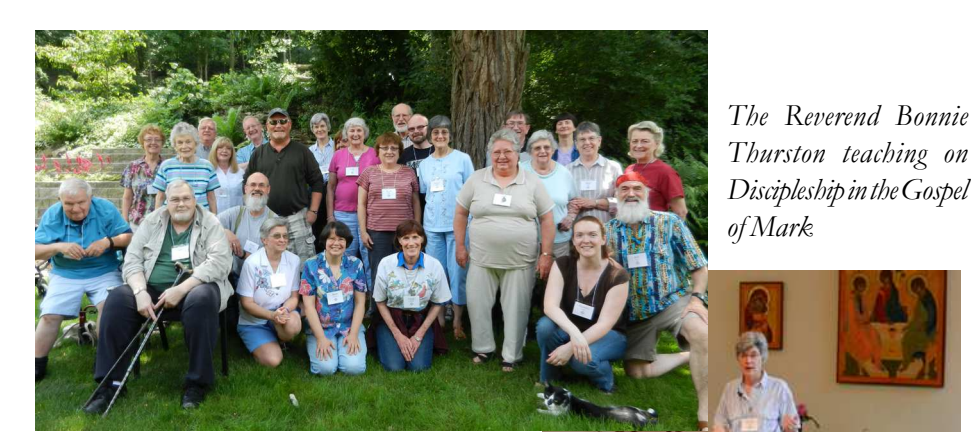
28th Annual Conference Attendees (plus Zac-the-cat)